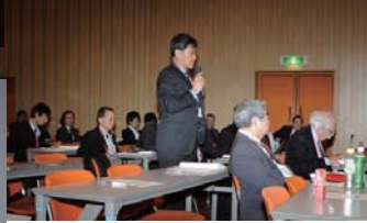
We had a lot of active discussion.